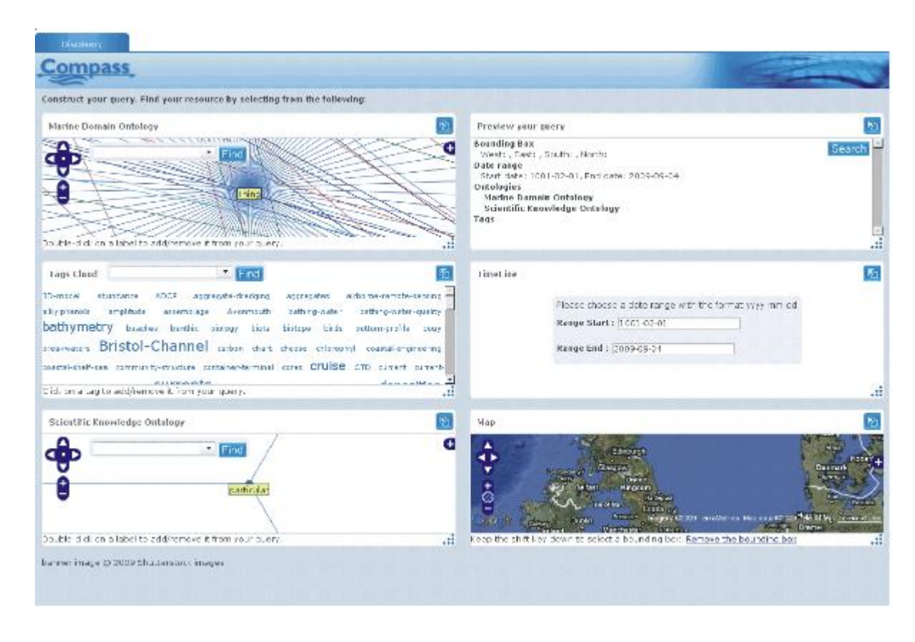
Figure 1 – COMPASS Discovery interface.

Project wiki - <a href="http://compass.edina.ac.uk/tiki-index.php">http://compass.edina.ac.uk/tiki-index.php</a> Project demonstrator (currently only working in Firefox 3.0.x and above) - <a href="http://compass.edina.ac.uk/beta/csw-broker/">http://compass.edina.ac.uk/beta/csw-broker/</a> Project demonstrator walk through Part 1 - <a href="http://www.youtube.com/watch?v=qiNVDnME674">http://www.youtube.com/watch?v=qiNVDnME674</a> Project demonstrator walk through Part 2 - <a href="http://www.youtube.com/watch?v=6h-reLHwRbI">http://www.youtube.com/watch?v=6h-reLHwRbI</a>