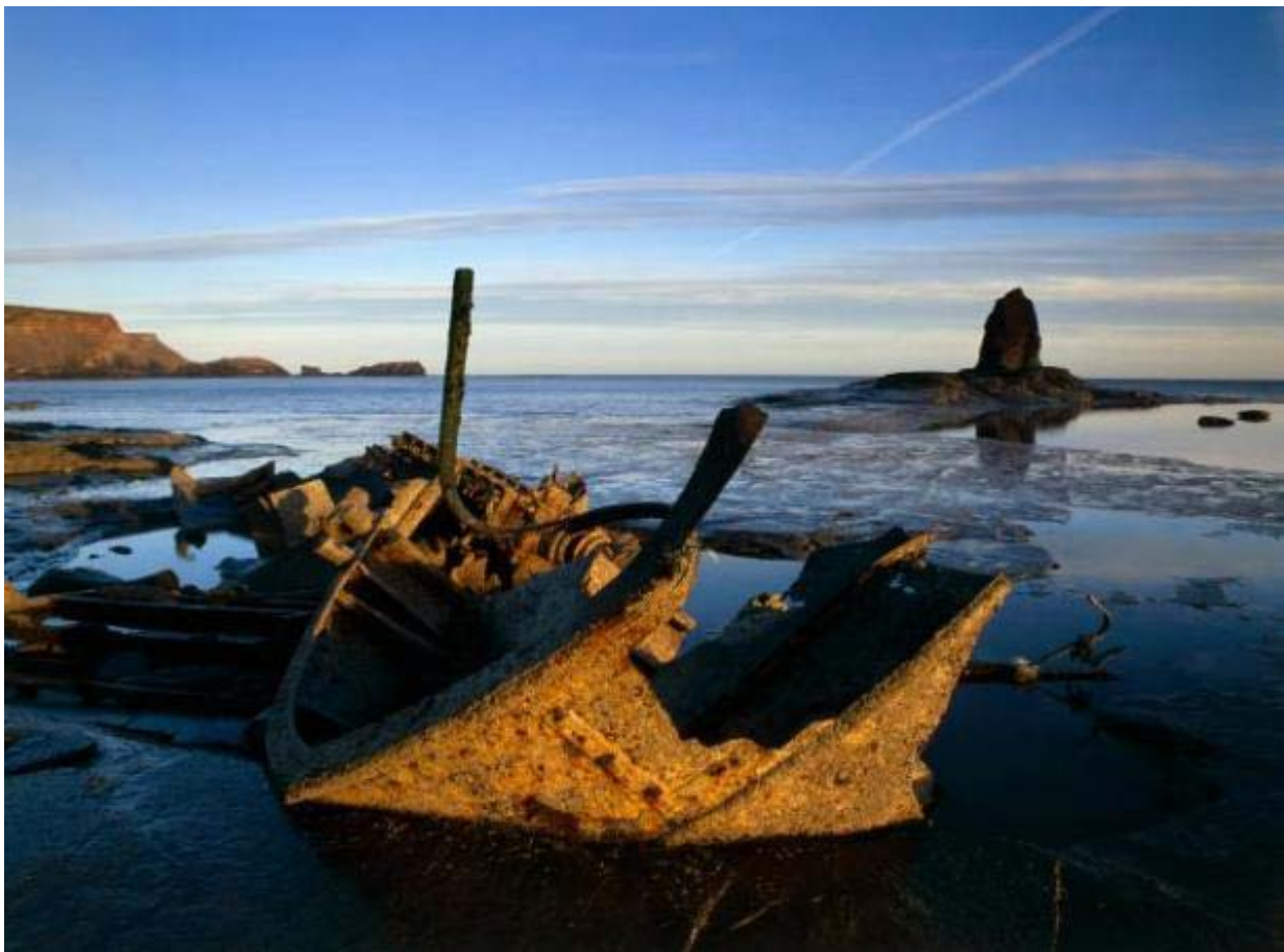
Figure 2, The wreck of the Admiral Van Tromp , a trawler which stranded near the Black Neb rock in 1976.

Some of the wrecks are completely submerged whilst others such as the Admiral Van Tromp (see figure 2) are in the intertidal zone where their remains provide an enigmatic reminder of our recent maritime past.